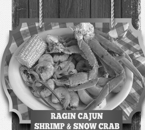
RAGIN CAJUN SHRIMP & SNOW CRAB

Choice of a fillet of fried catfish served on a bed of fries or blackened catfish served on jambalaya & a pistolette stuffed with crawfish or shrimp etouffee 19.99