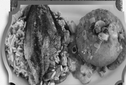
FILLET & PISTOLETTE