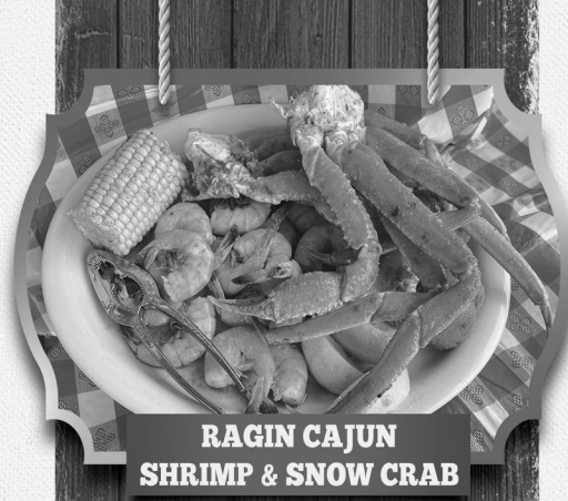
RAGIN CAJUN SHRIMP & SNOW CRAB

Choice of a fillet of fried catfish served on a bed of fries or blackened catfish served on jambalaya & a pistolette stuffed with crawfish or shrimp etouffee 19.99